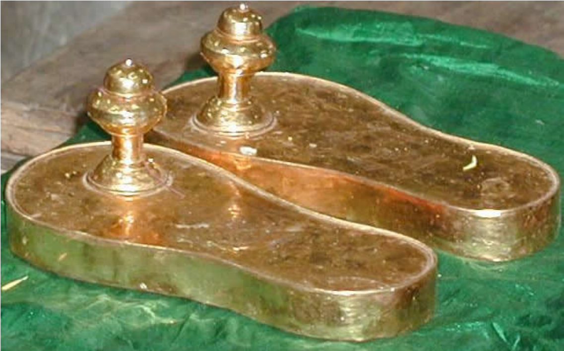
SrI MAIOla pAduka-i-s - SrI MaTham