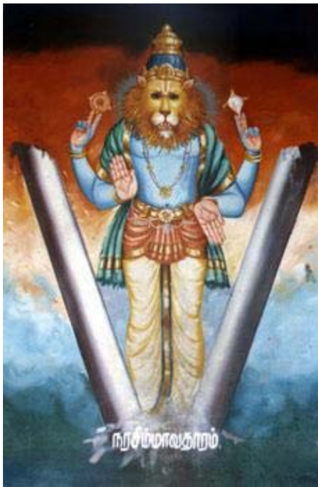
SrI Narasimha Avirbhavam

He is PraNatArthiharan. He is nata jana satyan (meyyavarkku aDiyavan). Therefore there is no surprise that He rushes to destroy the miseries of His devotees (bhakta-jana-artihantu:), when they cry out to Him like the Gajendran. When His dear devotee, Prahladan was in grave danger from the threats of his father, HiraNyakaASipu, our Lord jumped out of the pillar in the asura king's court to prove that His devotees' word will not prove false. The 23 rd Slokam of SrI VaradarAja PancASat refers to this stambhAvatAram by SrI Nrsimhan and His being inside all the vastus of the world now except that pillar in the darbhAr of HiraNyakaSipu (nUnam trailokyam etat akhilam narasimha garbham). As HiraNyan kept threatening his son Prahladan, You were sitting in Narasimha rUpam in all the objects of the world to jump out of it in case HiraNyan pointed out that particular object and asked whether it was the place