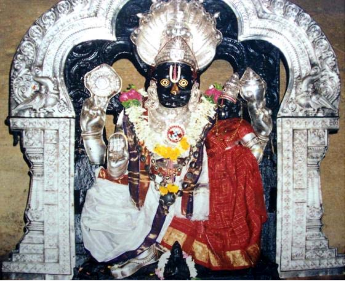
SrI lakshminrusimhar - SrI Ahobilam