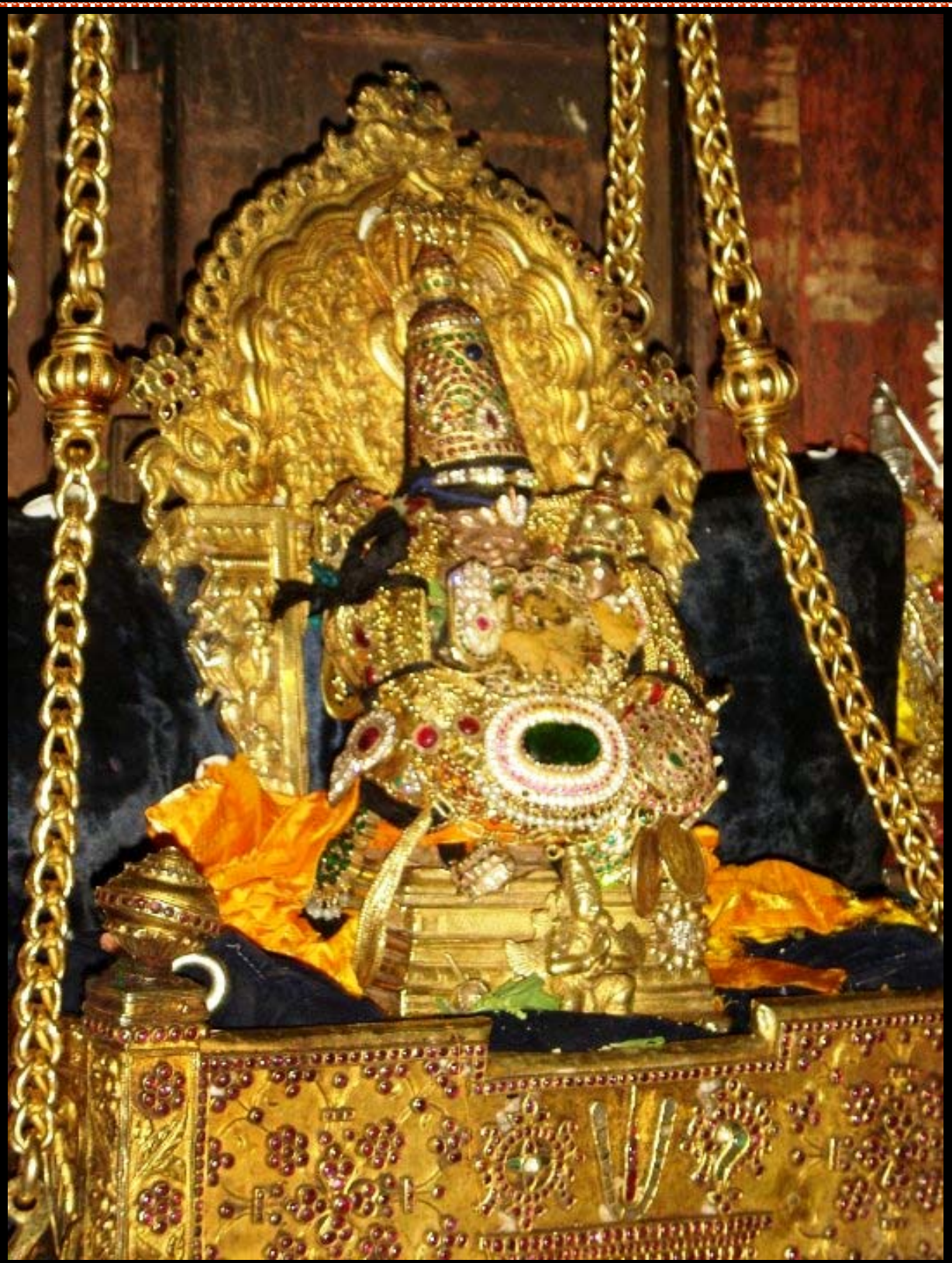
SrI MAIOlan - SrI MaTham