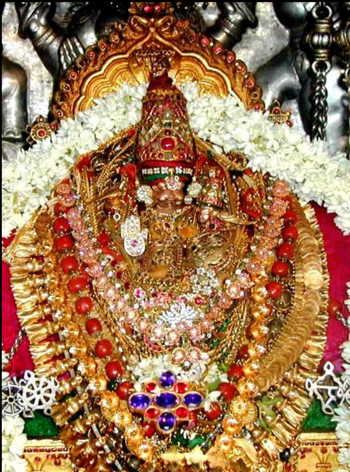
SrI MAIOLan - SrI MaTham