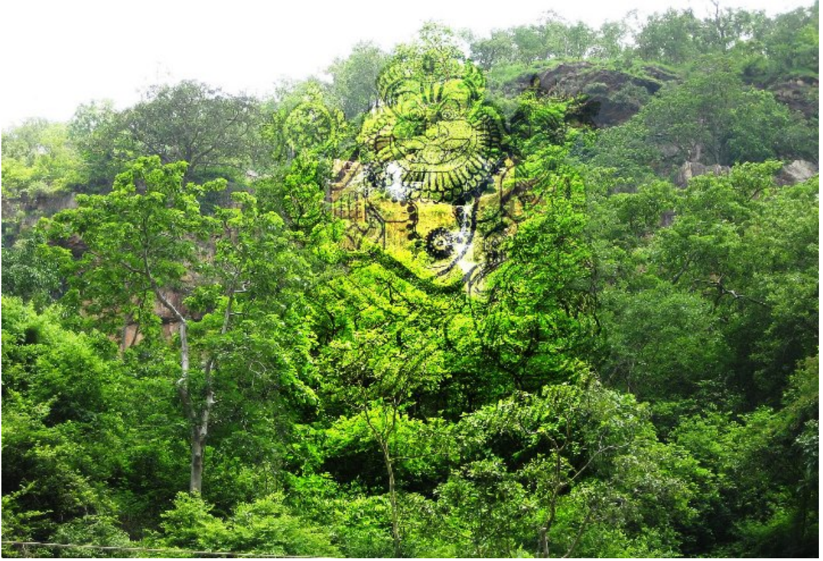
garuDAtri - SrI ahobilam