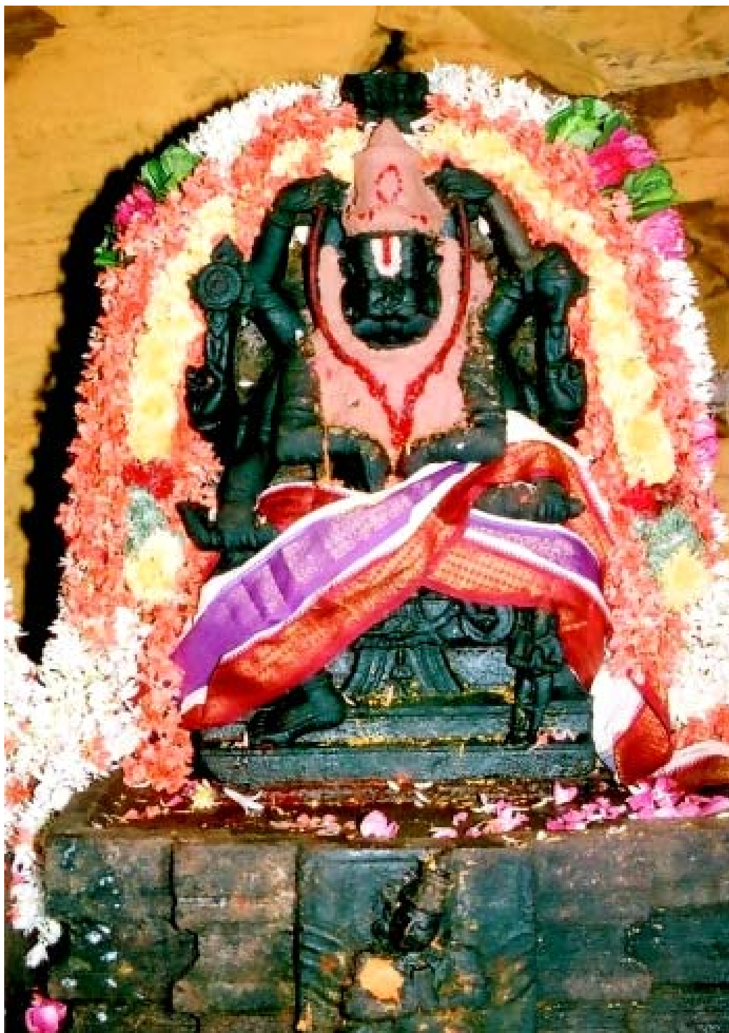
SrI jvAlA narasimhar - SrI Ahobilam

to His bhaktAs, He is SaraNagata Vatsalan, bhava hrt, loka guru, paramjyoti and ParamAnandan.